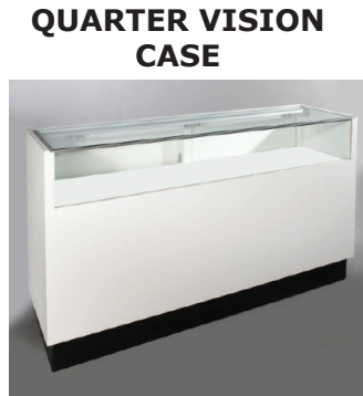
QUARTER VISION CASE