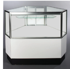
CORNER VISION CASE