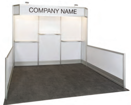
10 X 10