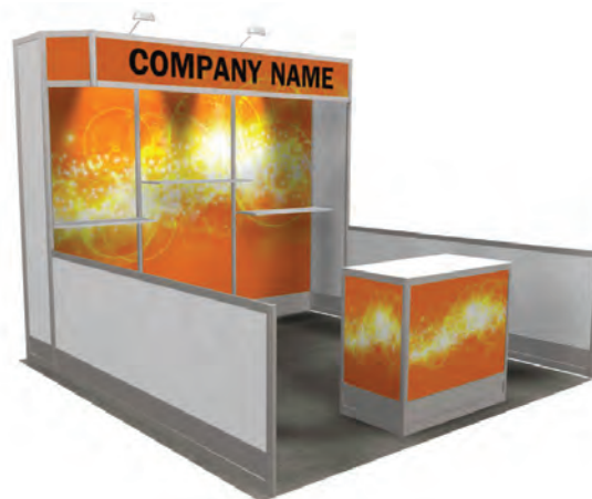
10 X 10