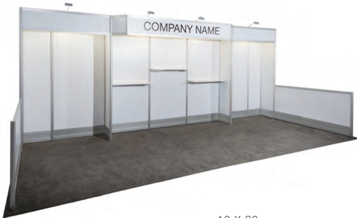
10 X 20