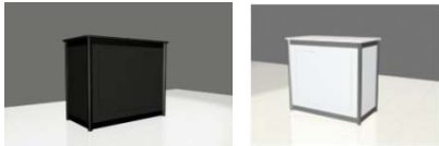
LC1 1Meter Wide